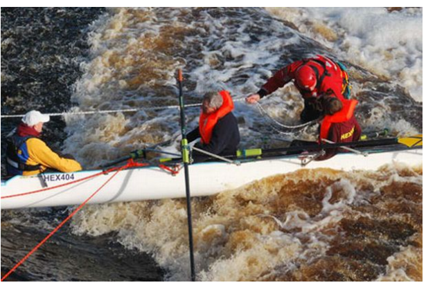
2010 – Hexham Rowers were rescued by Emergency Services. On this occasion the rowers didn't have to get out of the boat but were still required treatment for Hypothermia.

Accidents have happened in the past. Emergency services have been called out twice in 2010 and 2016. The rowers involved can attest to how terrifying the experience is. In 2014, 3 kayakers were killed in at the Riding Mill weir.